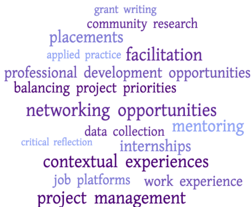
Figure 1 Additional Practice-Based Opportunities Students are Looking for as Part of Their Postgraduate Experience

Despite the diversity of current practice-based experiences on offer prior to this HASS Teaching Fellowship, focus groups with current students revealed they seek additional – and including a broader variety – of practice-based experiences. Importantly, some of these experiences identified by students are already on offer in the DP suite of programs; suggesting students seek deeper, or more sustained, and supported, experiences. It also suggests students may be unaware of some of the practice-based offerings available. In addition, some of the experiences students described also sit outside offerings detailed in Table 3; findings which point to gaps in current program offerings. These desired practice-based experiences – emerging from students themselves – are presented in Figure 1.