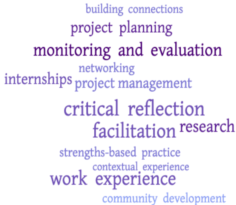
Figure 4 Types of Practice-Based Experiences Alumni and Industry Partners See as Valuable for Students

As Figures 1, and 4 demonstrate, there are significant overlaps between the views of students, and those of alumni and industry representatives. All identified facilitation, project planning and management, work experience, research-based projects, networking and building connections, alongside critical reflection and the opportunity to have contextual experiences as important postgraduate practice-based experiences. Other commonly identified skills included the capacity to work with, and across, diversity, as well as skills related to networking, resume and grant writing, as well as understanding organisational mandates and responsibilities. In combination, this set of experiences and subsequent skills development were recognised as supporting the next generation of practitioners for professions in the messy and contested spaces in which development practice occurs.