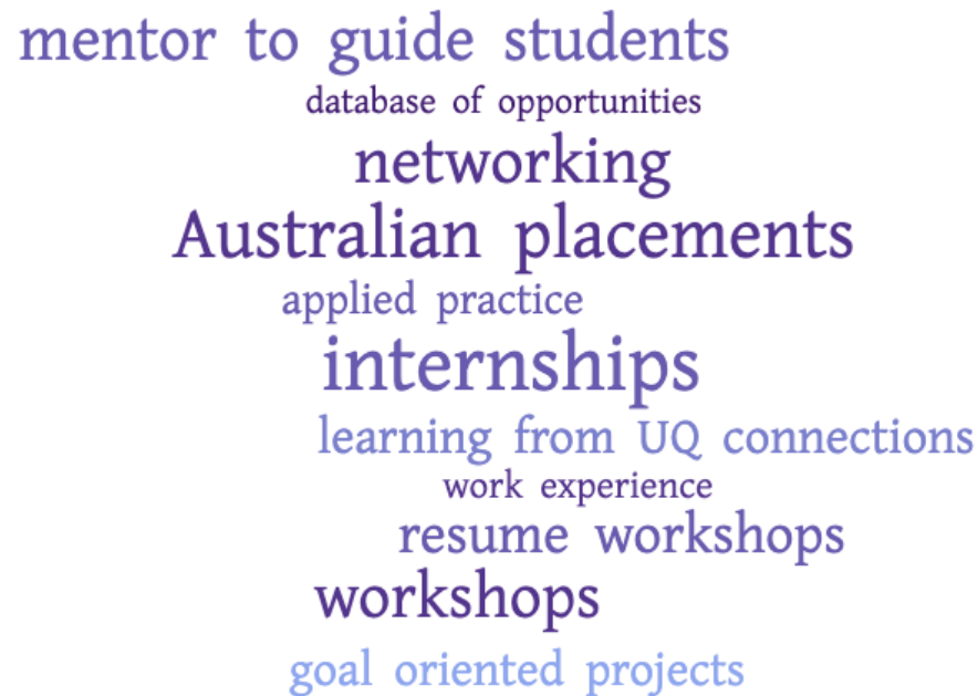
Figure 2 Additional Practice-Based Opportunities International Students are Looking for as Part of their Postgraduate Experience

Unsurprisingly, domestic students also expressed interest in undertaking internships and placement-based practice, including with the opportunity of gaining international – including developing country – experiences. Such findings demonstrate the global orientation of this student cohort and the importance of a holistic approach.