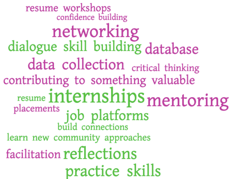
Figure 3 Additional Practice-based Opportunities Students are Looking for as Part of their Postgraduate Experience Considered from a Gendered Perspective

Overall, the entire student cohort aspired to seek additional practice-based experiences – thereby complementing their postgraduate studies in Development Practice. However, focus group discussions revealed that women and men frequently expressed differences (sometimes nuanced) in terms of the types of experiences they sought, the skills and competencies they aspired to develop, as well as understandings of the purpose of participation in these activities.