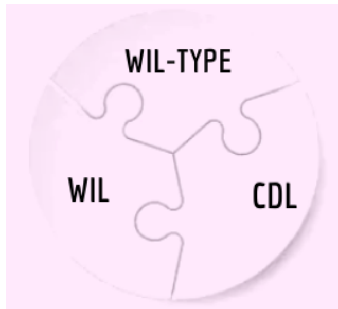
Figure 5 The Practice-Based Puzzle at the Postgraduate Level

Students often enter the postgraduate DP suite of programs with an already impressive and diverse set of practice-based professional experiences. Our students come with sometimes years of experience working across government departments, humanitarian and community-based organisations, resource companies and multilateral organisations, including as consultants, planners, project officers, policy makers, impact assessors, etc. Our postgraduate DP students require content and experience-specific professional practice opportunities that are able to complement – and challenge – these backgrounds. Quite simply, a one size fits all model to practice does not suit an often already qualified and experienced cohort.